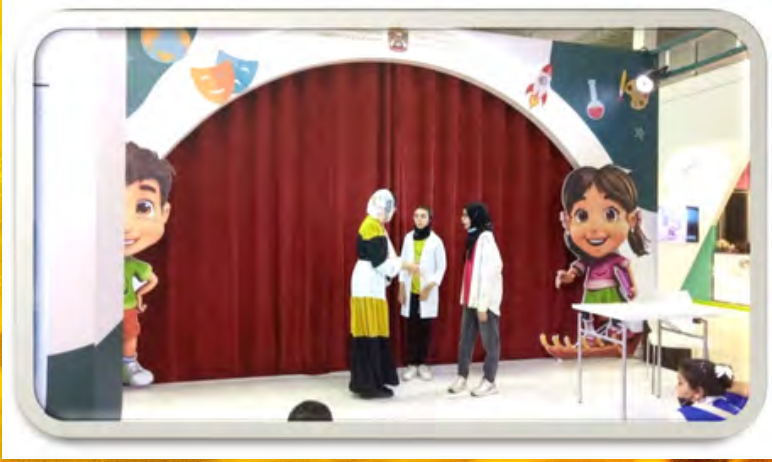
Theoretical Presentation in Expo Centre Sharjah during the Children's Reading festival