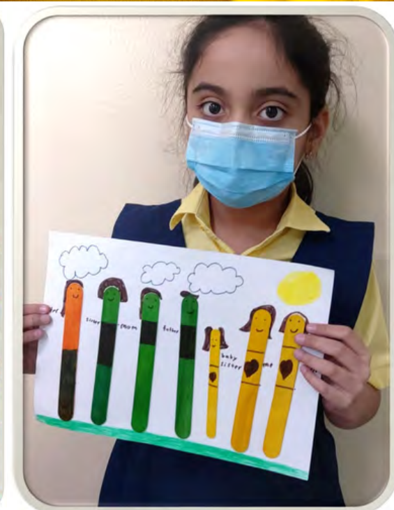
Our Primary students with beautiful hand-made greetings for their families