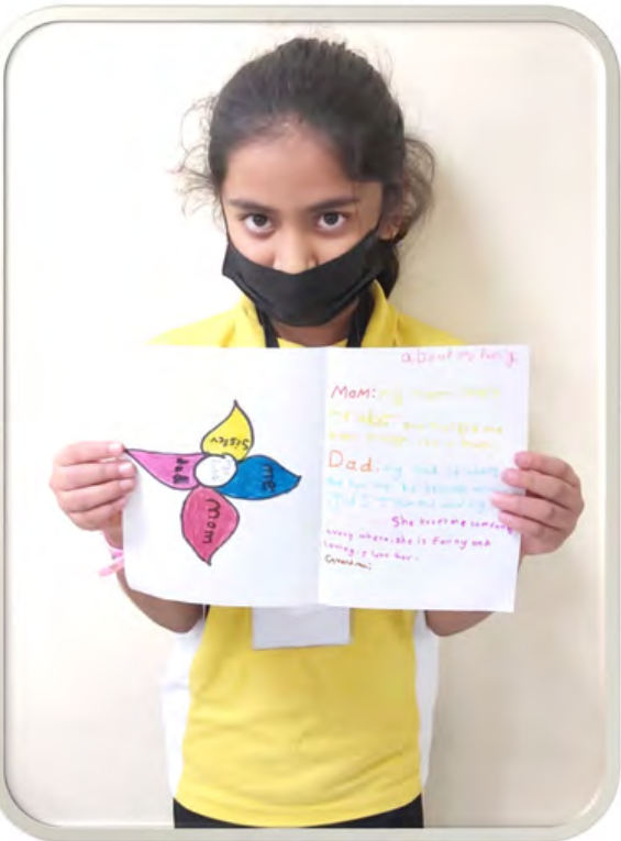
Our Upper Primary students with beautiful family trees and posters